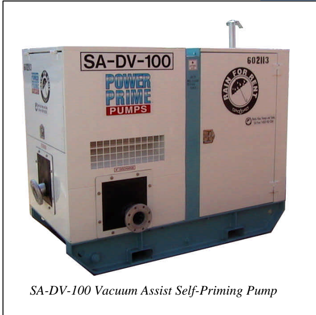
SA-DV-100 Vacuum Assist Self-Priming Pump