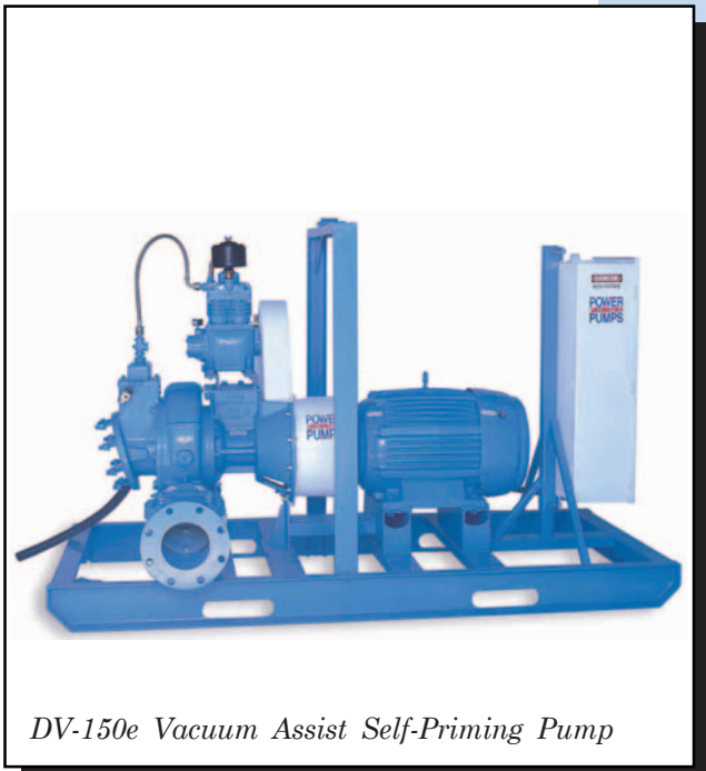
DV-150e Vacuum Assist Self-Priming Pump