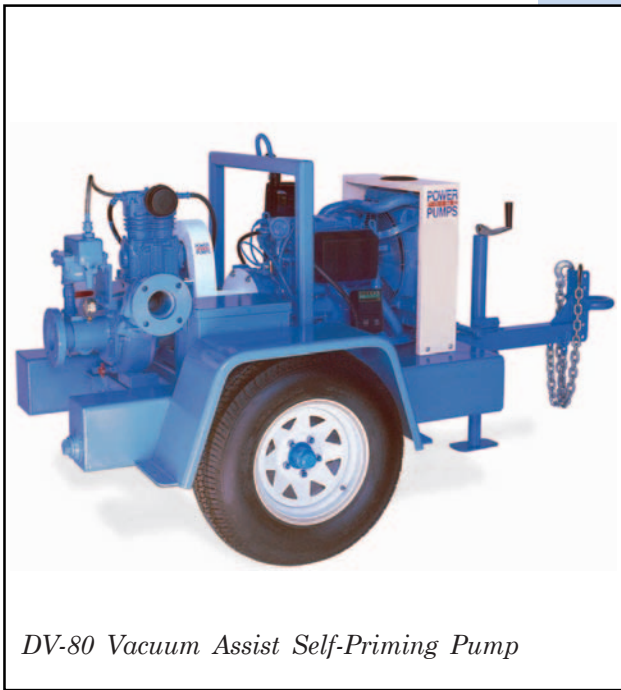
DV-80 Vacuum Assist Self-Priming Pump